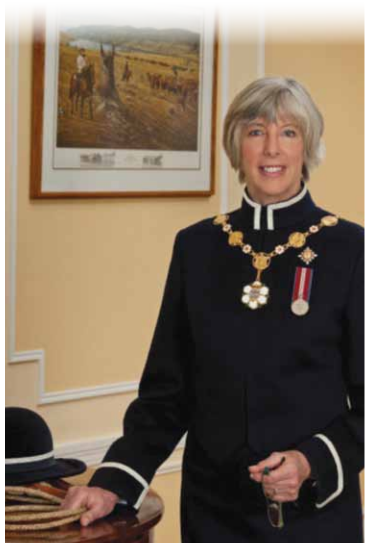
The Honourable Judith Guichon, OBC Lieutenant Governor of British Columbia