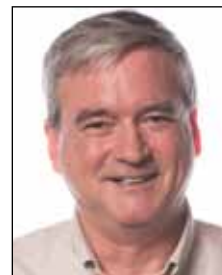
George Campbell Overland Press