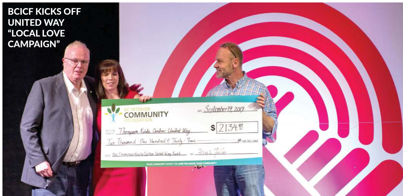
September 19 donation to the Thompson Nicola Cariboo United Way