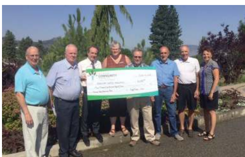
BCICF presentation to the Kamloops Hospice